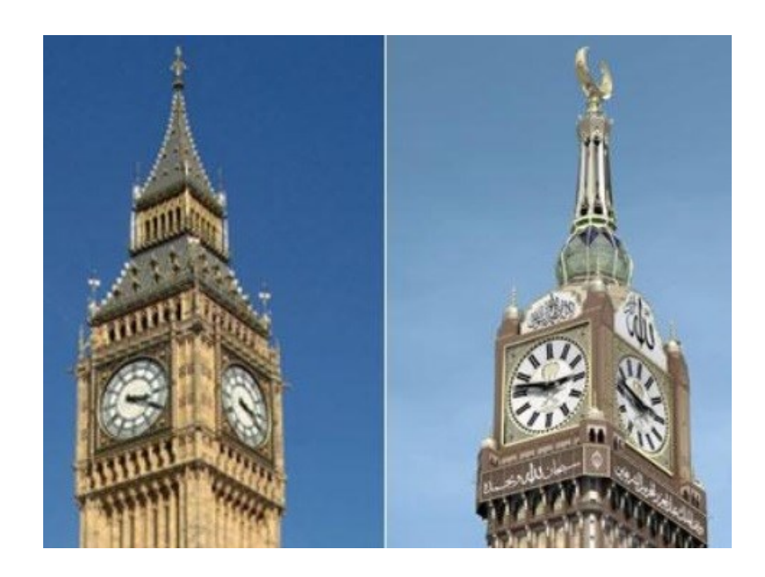
The little horn of Daniel 7 is the beast of Revelation 13: